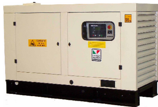
ACOUSTIC SET (LLD 410A)