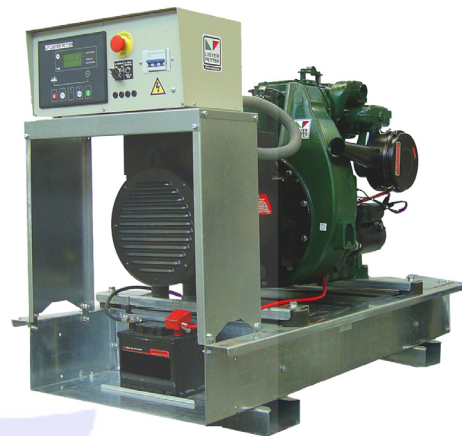
OPEN SET (HSL)