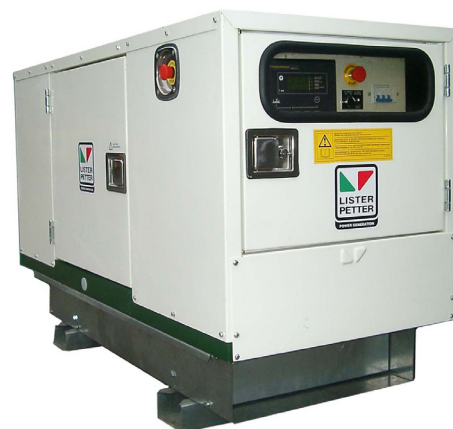
ACOUSTIC SET (HSLA)