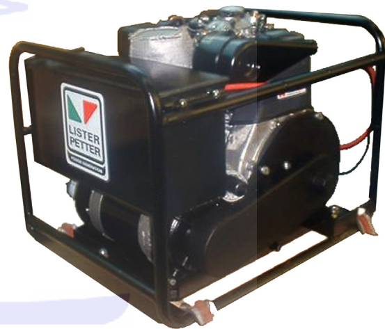
AD1 GENERATING SET